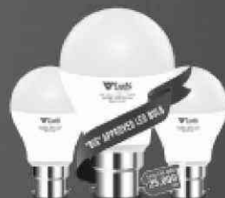
VOLUX LED BULB