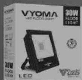
VYOMA LED FLOOD LIGHT