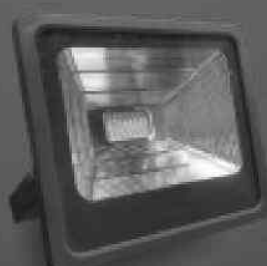
VOLUX SMD FLOOD LIGHT