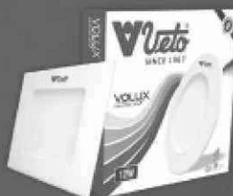
VOLUX SLIM LED PANEL