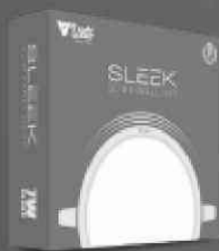
SLEEK SLIM PANEL LIGHT