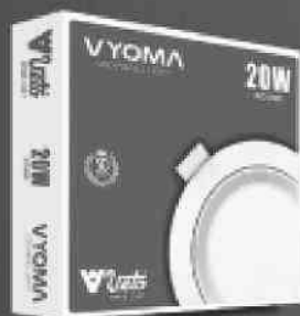
VYOMA LED PANEL LIGHT

Committed to Power Saving for the Nation