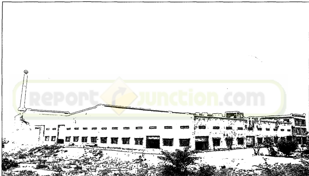
VIEW OF OUR NEW UNIT AT RAJAPPOOR- MAHABOOB NAGAR DIST.