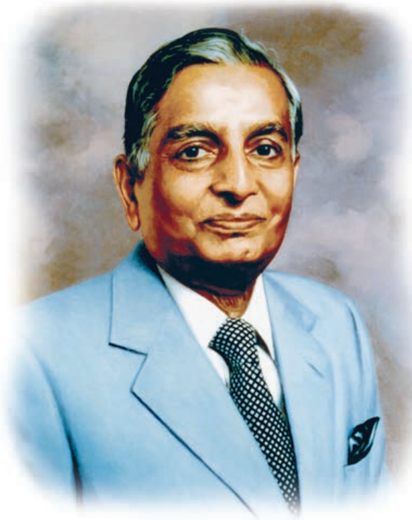
Syt. Madhav Prasadji Birla (1918-1990)