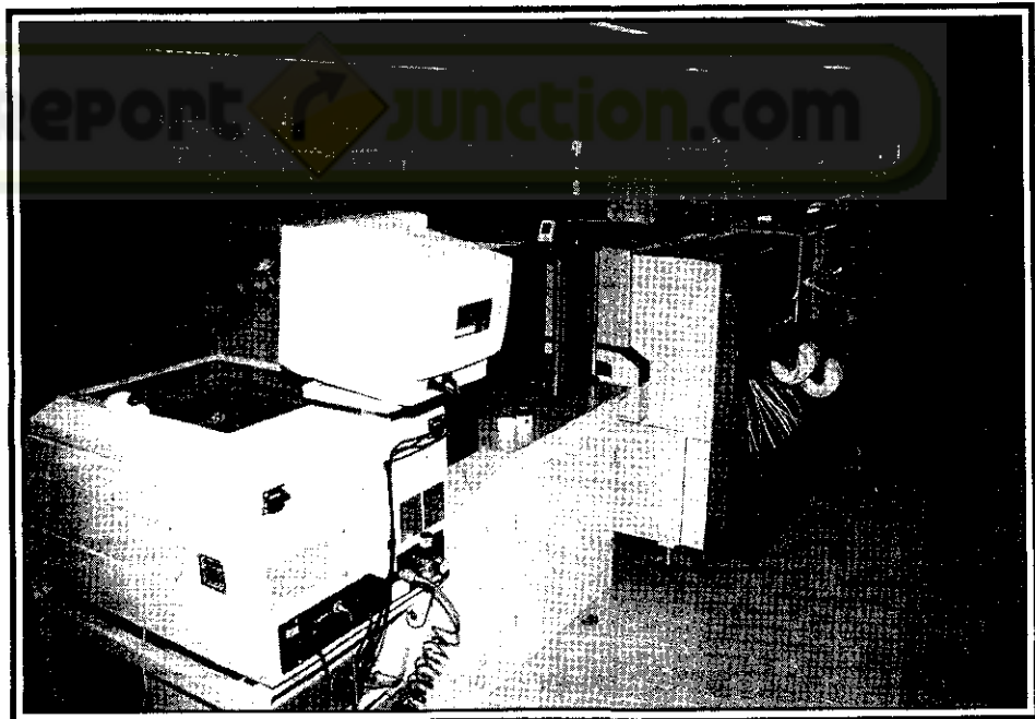
A VIEW OF SMT LINE