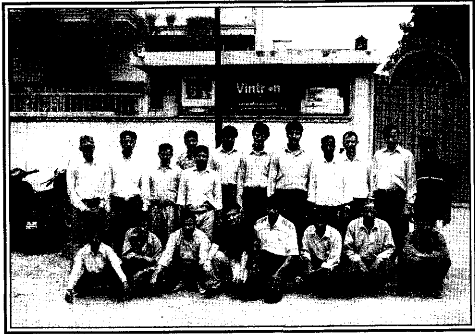
OUR WORKERS OUR STRENGTH