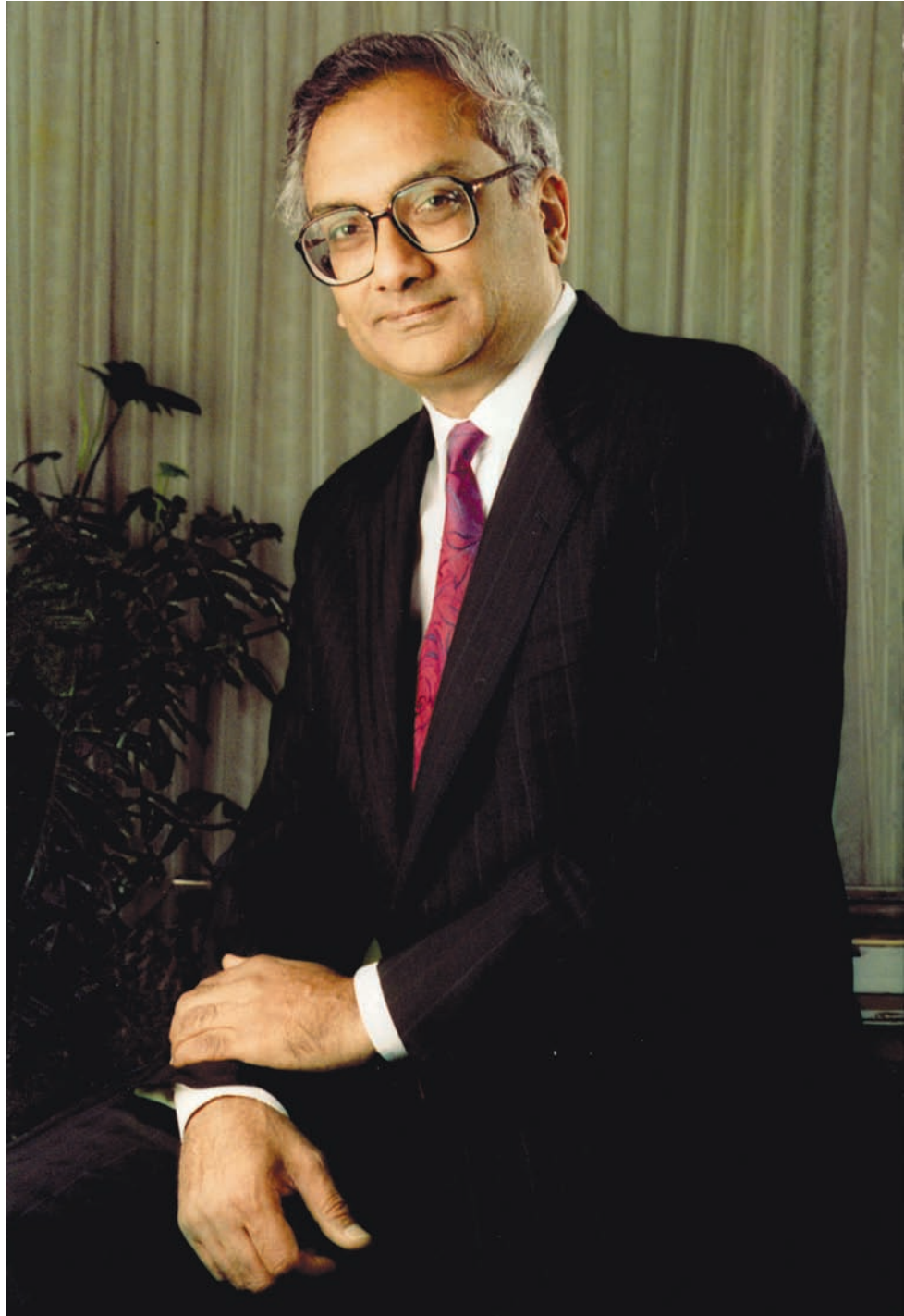
Mr. Aditya Vikram Birla We live by his values. Integrity, Commitment, Passion, Seamlessness and Speed.