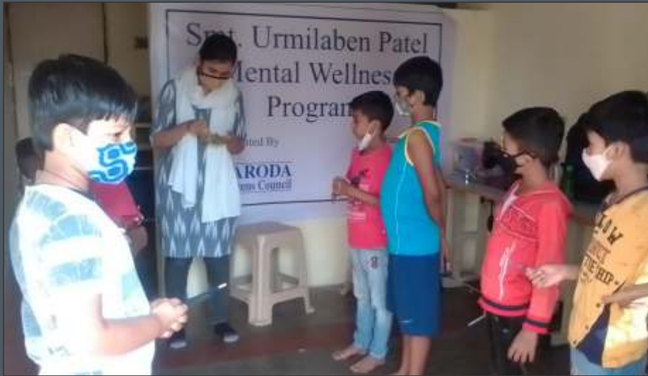
A fun game with Savli village Children under Mental Wellness Program