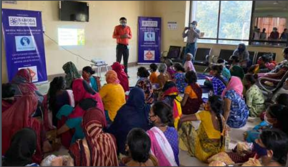
Education Program towards improvement of Woman health at Rukmani Chainani Prasuti Gruh at SSG Hospital, Vadodara conducted by Baroda Citizen Council.