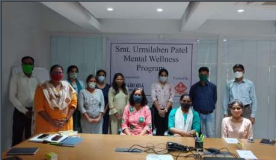
Training of Trainers at Baroda Citizen Council