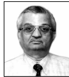
Dr. Anil Kakodkar Director