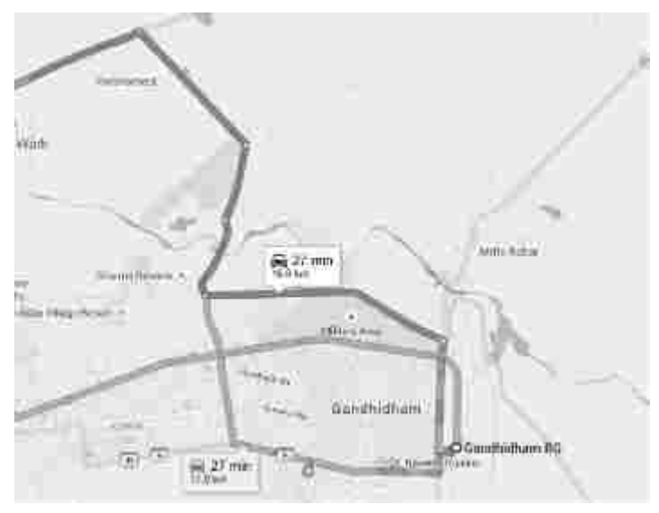
Route Map - Gandhidham Station to Welspun