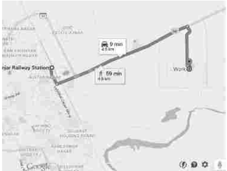
Route Map - Anjar Station to Welspun