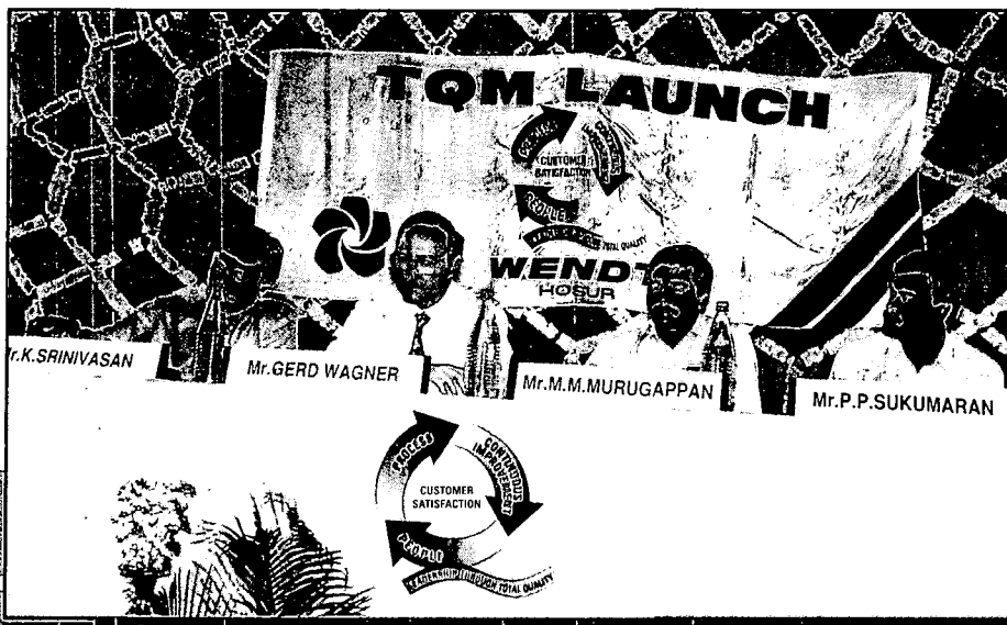
TQM-Launch -new initiative