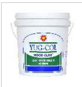
YUG-COL WOOD GLUE